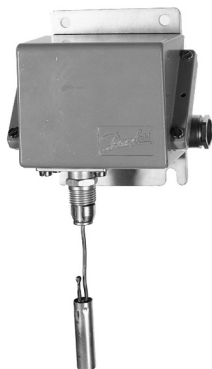
KPS with rigid sensor