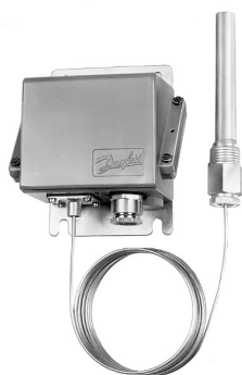
KPS with remote sensor