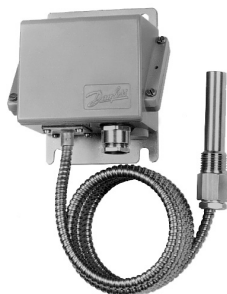
KPS with remote sensor and armoured capillary tube

When ordering, please state type and code number